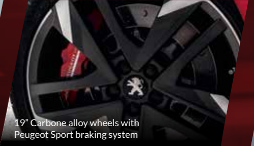
19" Carbone alloy wheels with Peugeot Sport braking system