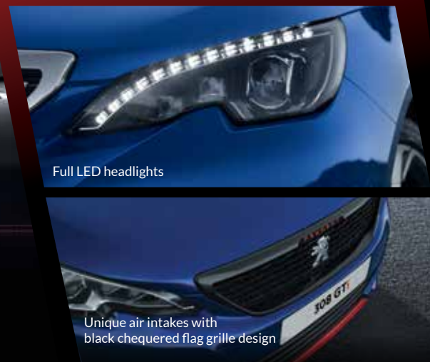
Unique air intakes with black chequered flag grille design