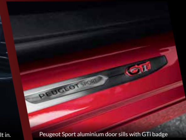
Peugeot Sport aluminium door sills with GTi badge