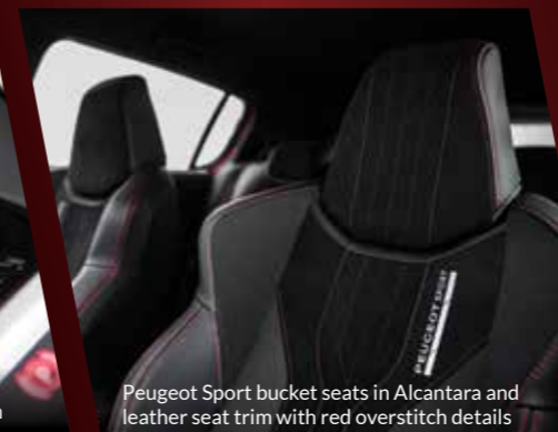
Peugeot Sport bucket seats in Alcantara and leather seat trim with red overstitch details