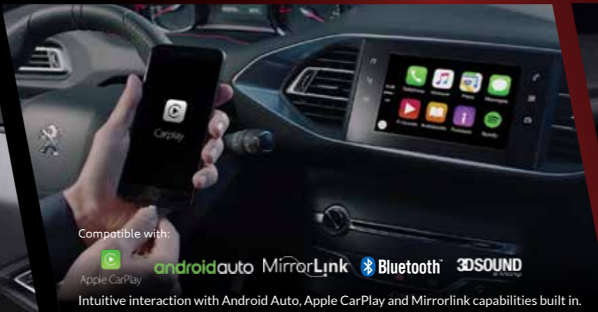
Compatible with: Apple CarPlay, android auto, MirrorLink, Bluetooth, 3DSOUND Intuitive interaction with Android Auto, Apple CarPlay and Mirrorlink capabilities built in.