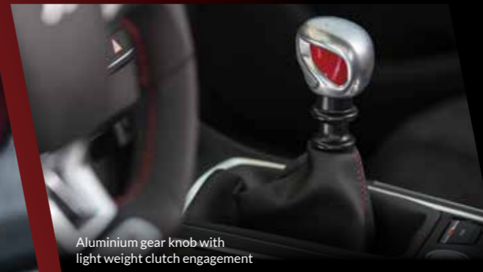
Aluminium gear knob with light weight clutch engagement