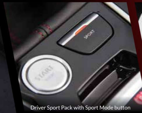
Driver Sport Pack with Sport Mode button