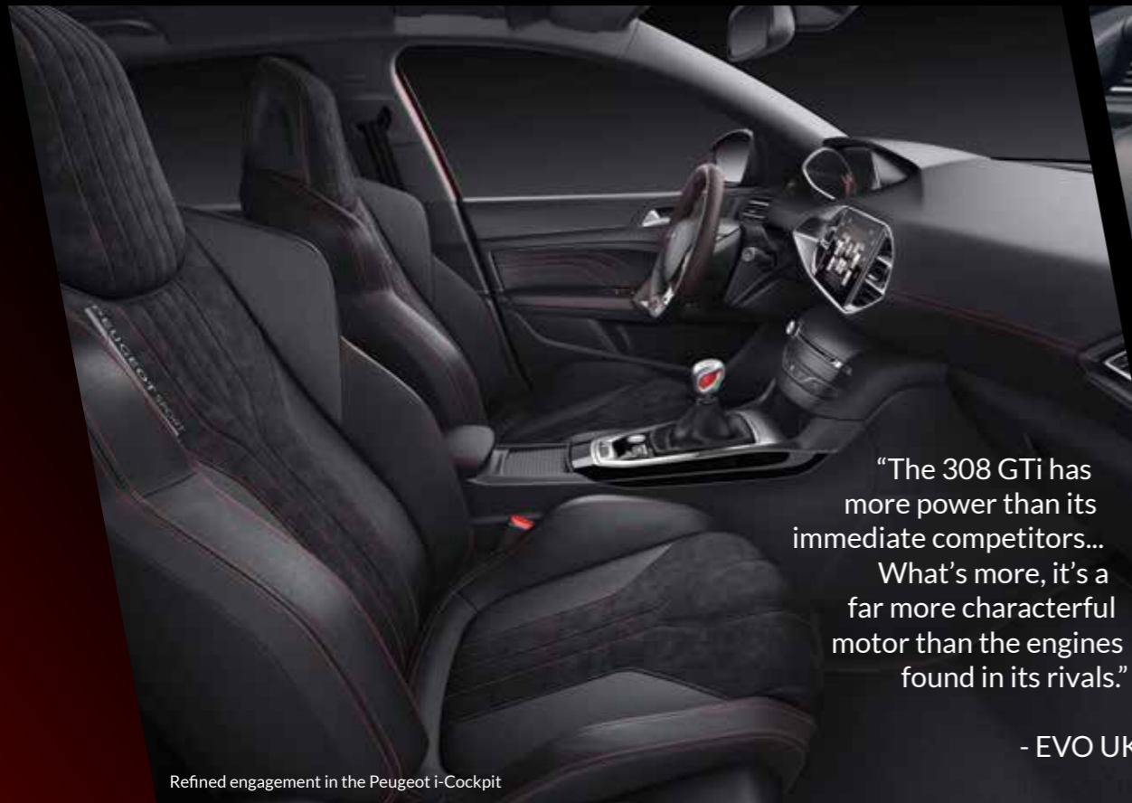
Refined engagement in the Peugeot i-Cockpit

+250 km/h Top speed (electronically limited)